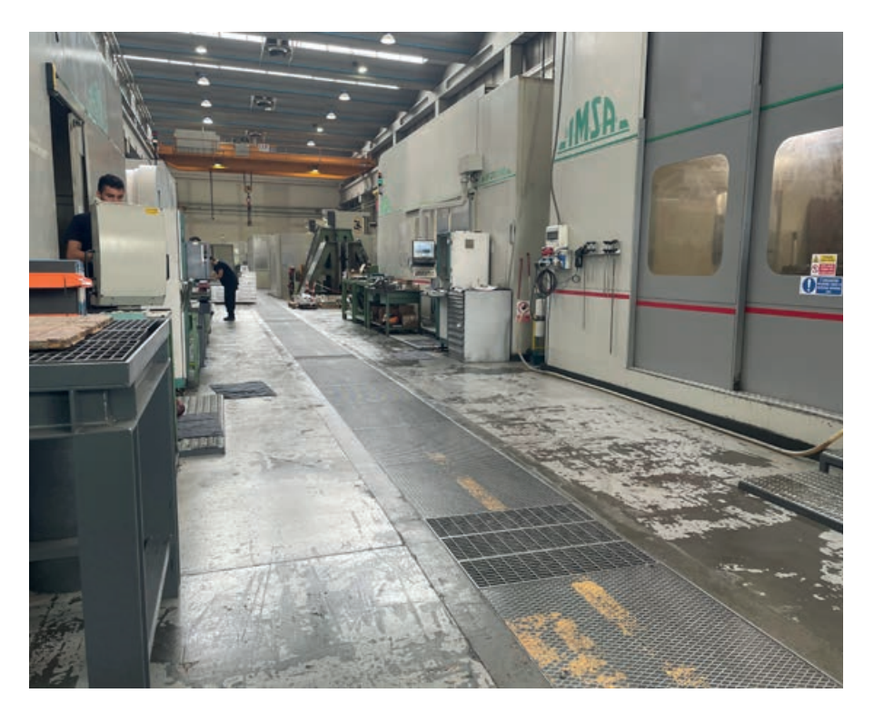
The deep drilling island contains 4 I.M.S.A. machines: MF 1000 BB, MF 1500 BB/2, MF 2000 BB and the newly-installed MF 1250/2FL